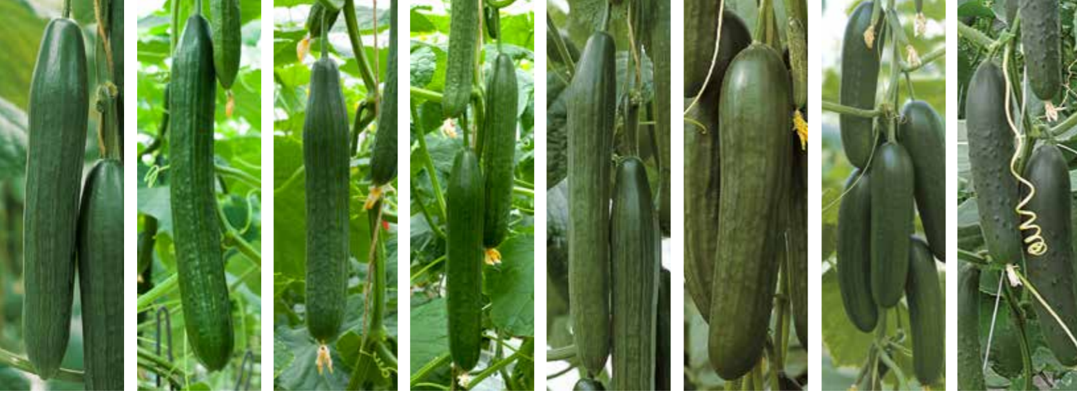
Kalunga Dee Gree Dee Lite Dee Zire Tyria Passandra Picolino Akito